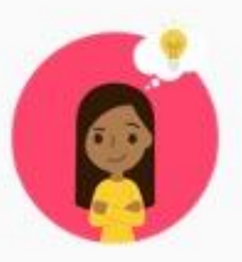
As students gain experience, knowledge, and skills, they can reassess and change their plans for the future.